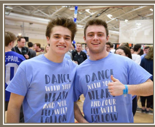
SERVICE AND FIRST GENERATION SCHOLARS PROGRAM