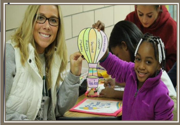
COMMUNITY- ENGAGED LEARNING